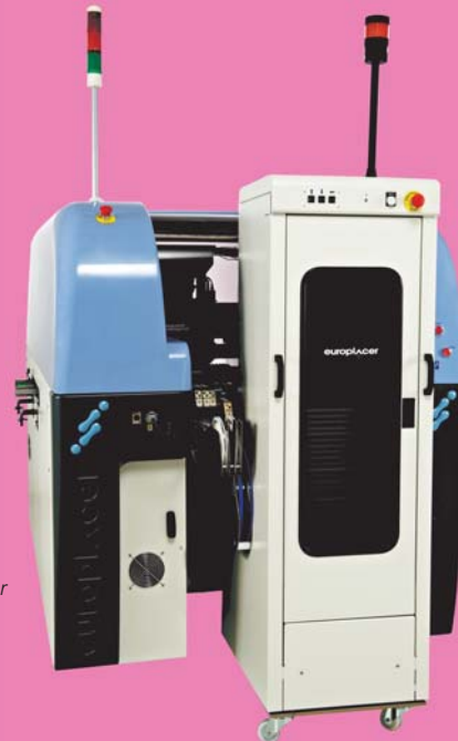
Matrix tray sequencer 30 positions can be fitted at the rear